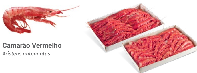
Camarão Vermelho Aristeus antennatus