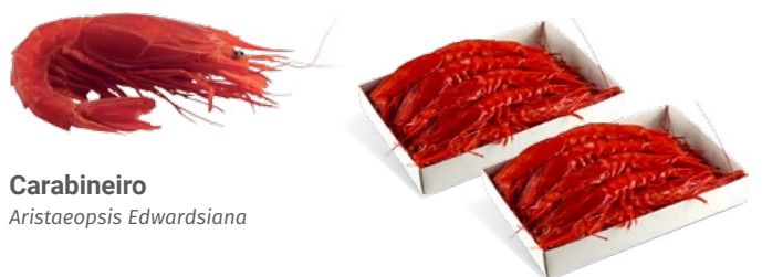
Carabineiro Aristaeopsis Edwardsiana