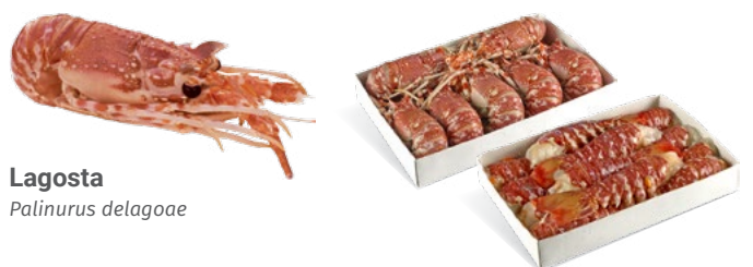
Lagosta Palinurus delagoae