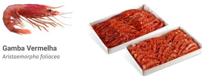
Gamba Vermelha Aristaemorphia foliacea